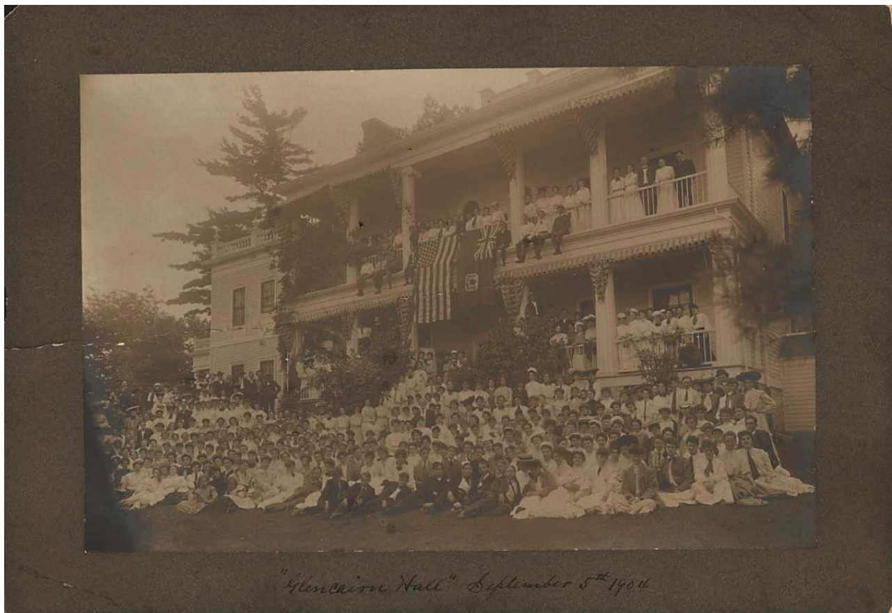
"Glencairn Hall" September 5 th 1906